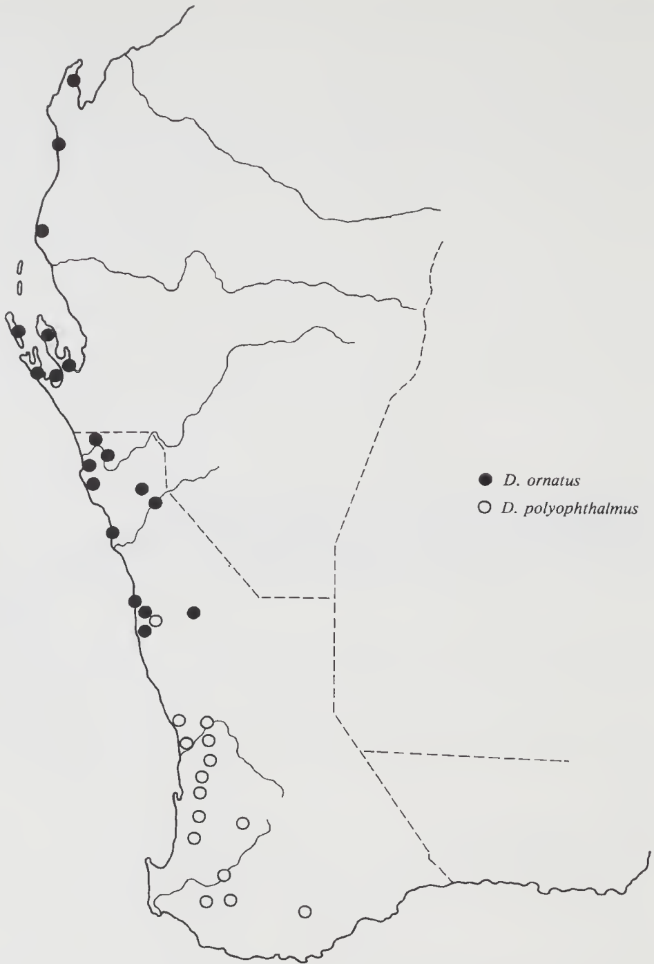
Fig. 1. Map of south-western Western Australia showing location of specimens of Diplodactylus ornatus and D. polyophthalmus .